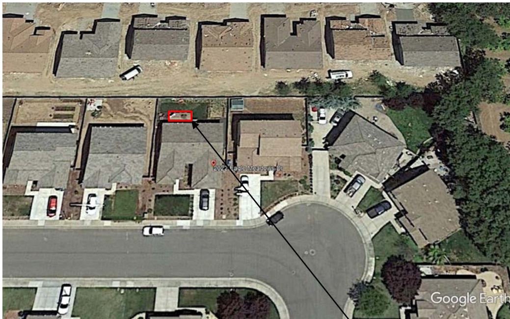
Figure 2: Project location

The applicant proposes to construct a 13' x 32' patio cover over an existing concrete pad.