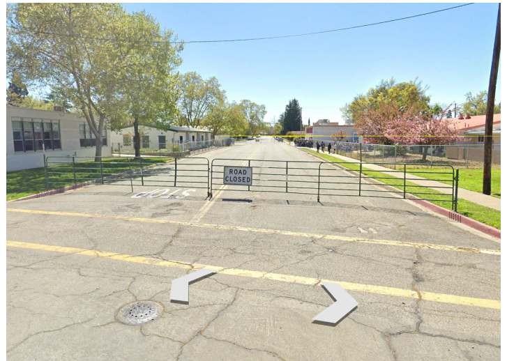
Sycamore St looking South