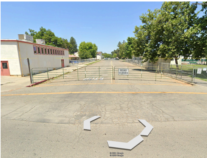
Magnolia St looking North