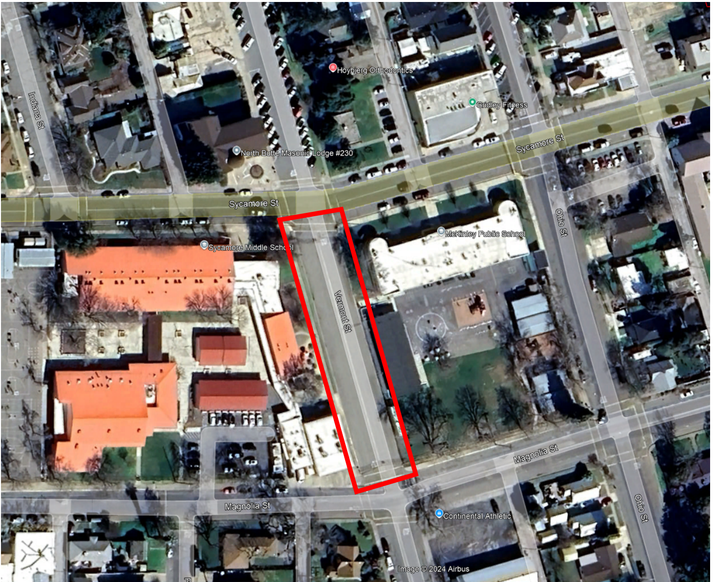
Vermont St Between Sycamore St and Magnolia St