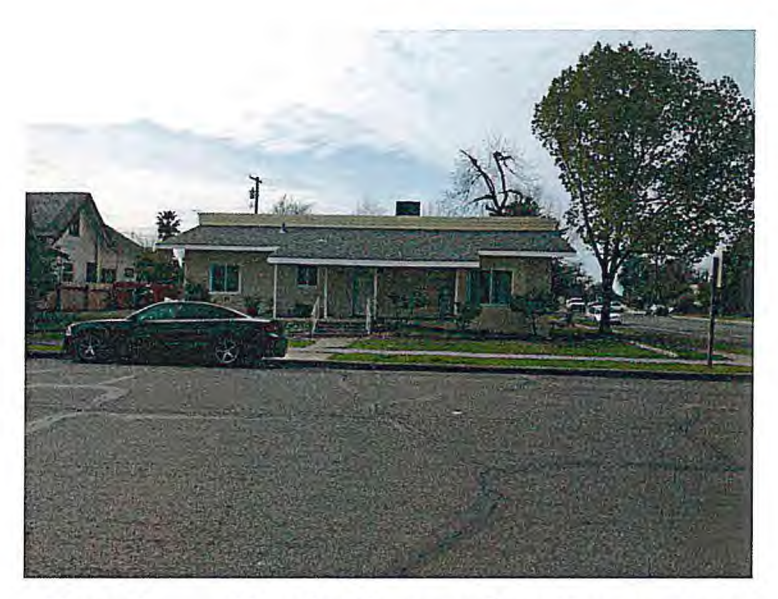
Figure 3: View looking west from Vermont Street At primary residence