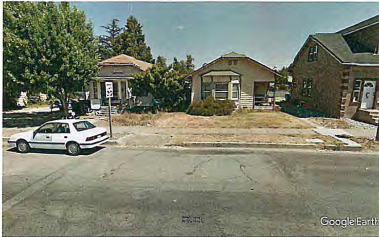
Figure 2: View looking north