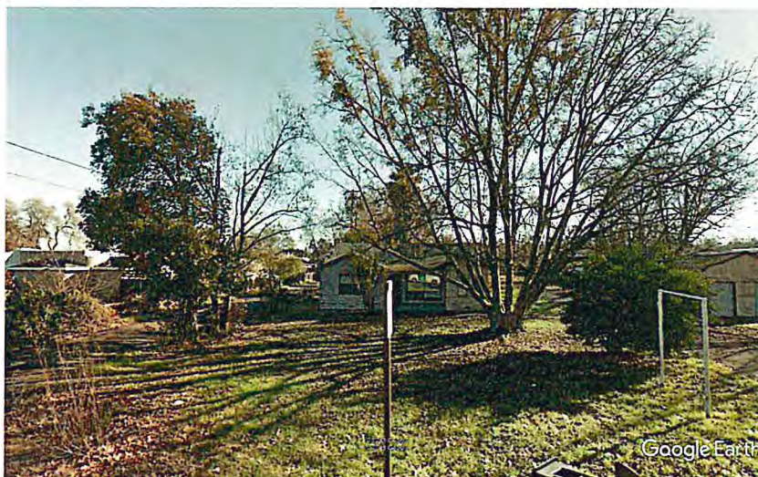
Figure 3: View looking east from Highway 99