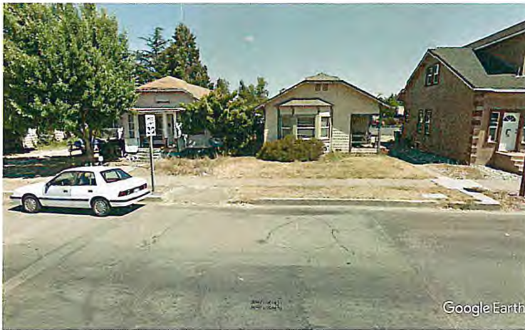
Figure 2: View looking north